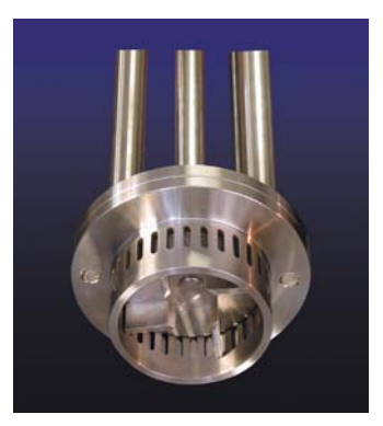
Saw-tooth disperser blade