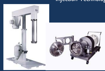
Batch and Inline Ultra-High Shear Mixers (Special Design Rotor/Stators)

For more information, visit www.highshearmixers.com