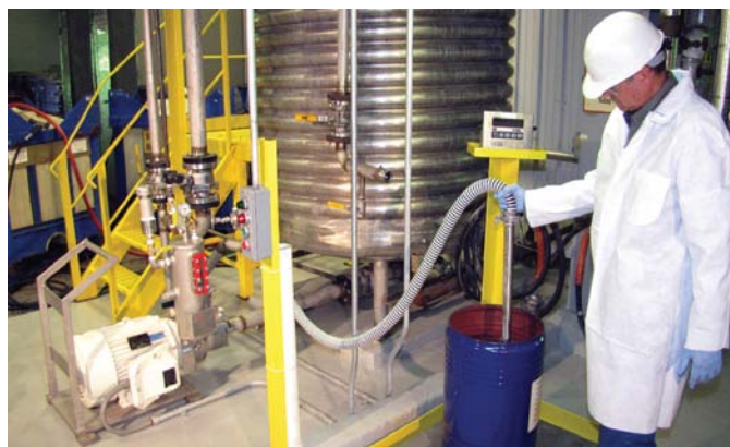
A Ross inline SLIM mixer connected to a 1,000-gallon vessel for recirculation.

Or visit the website : http://www.highshearmixers.com/slim-models.html